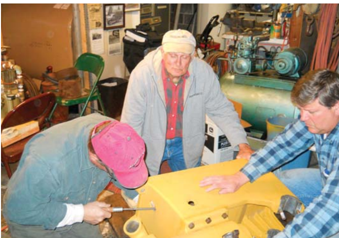
Installing Hercules fuel tank